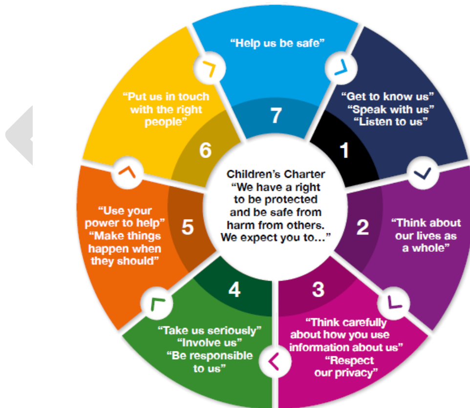
Figure 1: Expectations from children who may be involved in child protection processes.