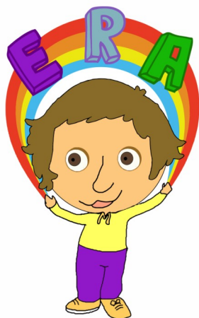
East Renfrewshire ASN Parent Action Group