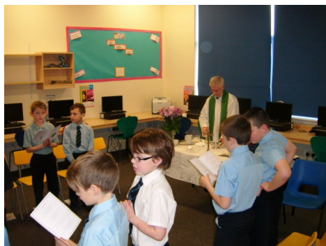
P5 Class Mass

St Thomas bless our school. We ask you to bless all of the adults and children in it. Give us the strength and courage to always do our best. Help us to show love for one another and to treat those we meet in our daily lives with care, respect and understanding. Amen