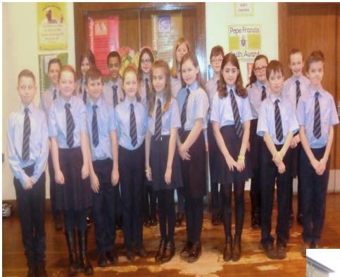
Primary 6 led a special assembly about The Pope Francis Faith Award