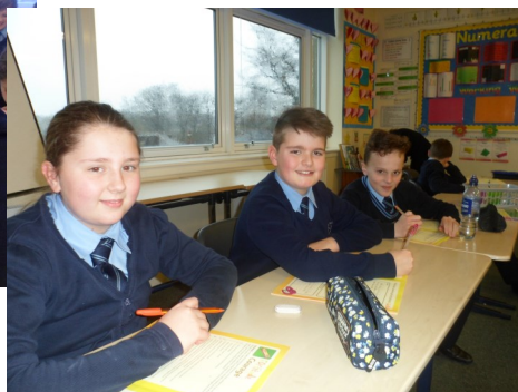
Primary 7 working on their Pope Francis Faith Award Journals

Our Catholic school community holds Gospel values at the heart of everything we do. Catholic education provides opportunities for all young people to fulfil their potential while deepening their understanding of their faith through encounters with God.