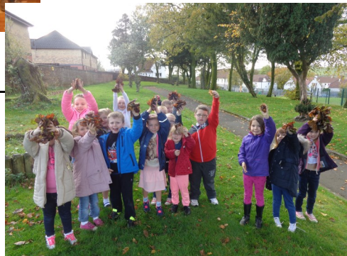
'Make a Difference Day October 2015'