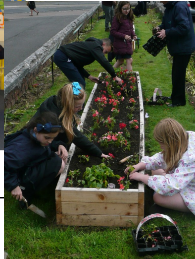
Planting with children from Neilston Primary