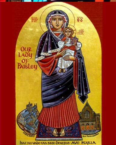
Our Lady of Paisley; pray for us