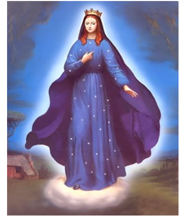
OUR LADY OF PONTMAIN/ OUR LADY OF HOPE

In the Christian tradition, Holy Saturday is the day of hope. Situated between Good Friday and Easter Sunday, it is a kind of no man’s land between the despair of the disciples and their joy on Easter morn. It is the place where hope is born.