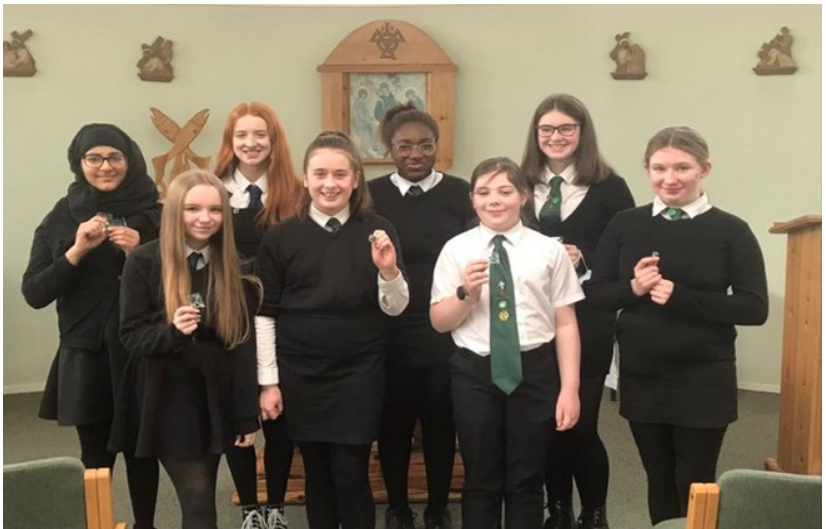
Our Fair Trade Group are presented with their badges.