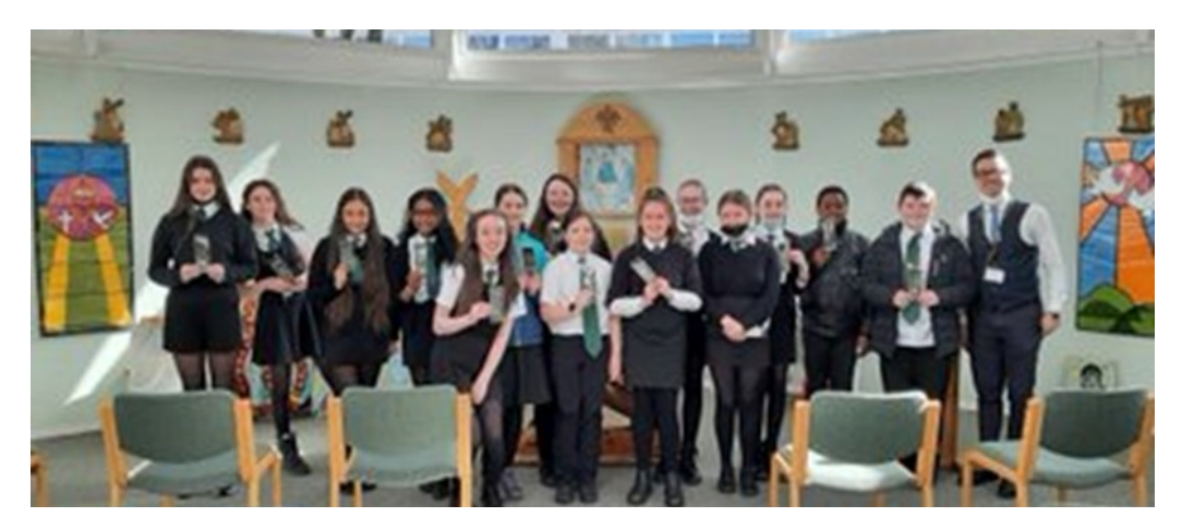
Our Mysterious Tuesdays group are presented with their badges.

At our junior awards ceremony pupils were presented with their House Saint award. It is hoped that we will continue to develop this initiative into S2 and allow pupils to build on their positive impact across the school.