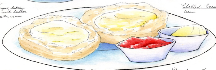
Clotted Cream cream