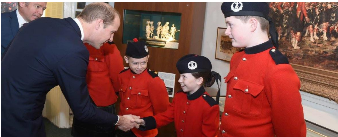
Prince William meets students from Queen Victoria School.

Registered Charity SCO42084 and Accredited Museum.