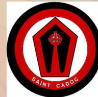
St Cadoc's Primary School and Nursery Class