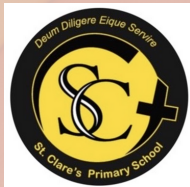
St Clare's Primary School