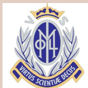
Our Lady of the Missions Primary School