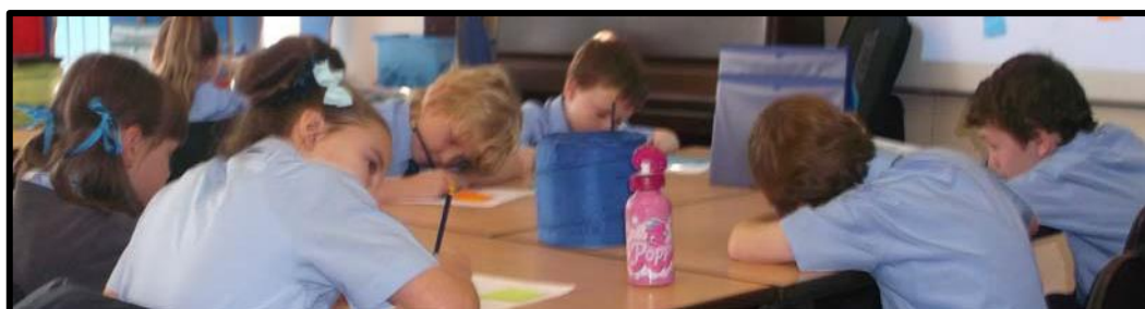
P4-7 Pupil Council hard at work