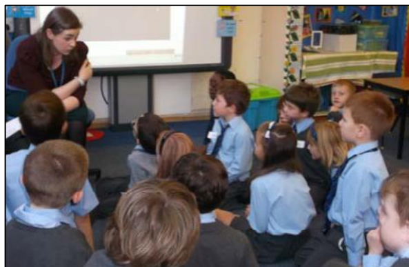
P1-3 Pupil Council Meeting

We have lots and lots of different committees which run at different times of the year. Even our youngest pupils are asked to discuss ways to improve our school and we think we are each given the chance to contribute to making Saint Joseph's the best school possible.