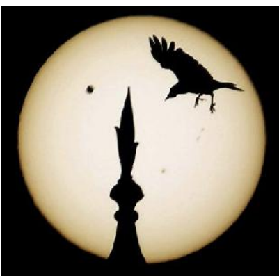
Above: A bird landing on one of the spires of the Taj Mahal in Agra, India, is silhouetted against the sun and Venus