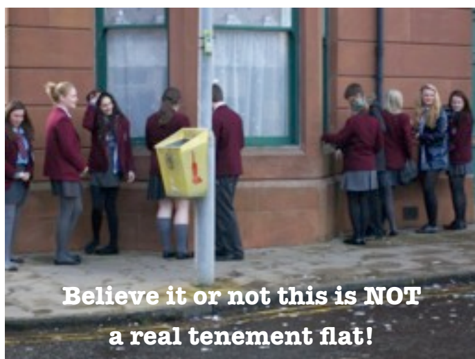
Believe it or not this is NOT a real tenement flat!