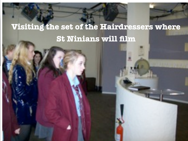
Visiting the set of the Hairdressers where St Ninians will film