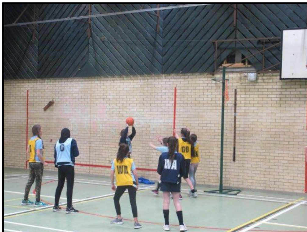
St Ninian's Sports Hall

https://blogs.glowscotland.org.uk/er/StNinians/