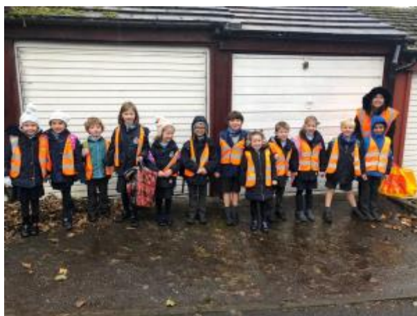
1 - walk to school week

The parking at the school entrances is an ongoing issue. You will note that this is raised in every newsletter. The double parking, allowing children to alight from the car onto the road side, parking in the 'drop-off' zone are all examples of really selfish and inconsiderate practice. We had a near miss with a pupil last week and I am not sure what else we can do as a school other than remind all parents/carers that we rely on them to drop the children off safely in the morning. Our JRSO are coordinating walking buses this week. We managed one bus due to minimal volunteers. It would be great if anyone willing to lead walking buses from other locations could contact the school. This would ease congestion and go towards resolving the potential road rage situations happening on a daily basis.