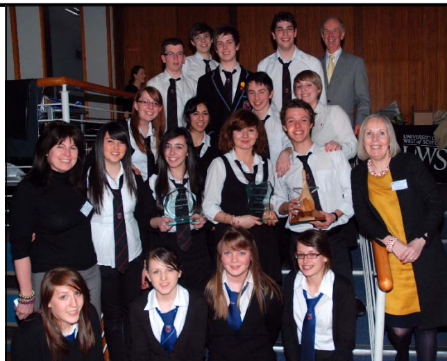
Urban Soles Mearns Castle S6 Young Enterprise Team 2009

U rban Soles is our S6 Young Enterprise Team – you may well have bought a pair of our designer shoes! After an extremely busy year which saw us create from scratch a highly professional company, organise – and enjoy thoroughly – a Halloween Ball, display and sell our unique wares at Braehead – gaining critical acclaim from Ugg boots no less! - AND win the first prize overall at the Renfrewshire Finals of Young Enterprise, held at the University of the West of Scotland, we have just taken part in the Scottish finals held in the City Halls in Glasgow. At this event, YE teams from every region in Scotland give a business presentation, produce and discuss a professional Company Report and display their product or services on a stall of their own design.