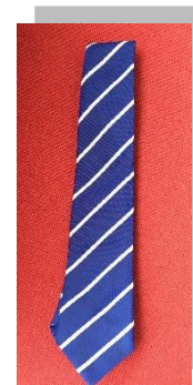
S1 – S6