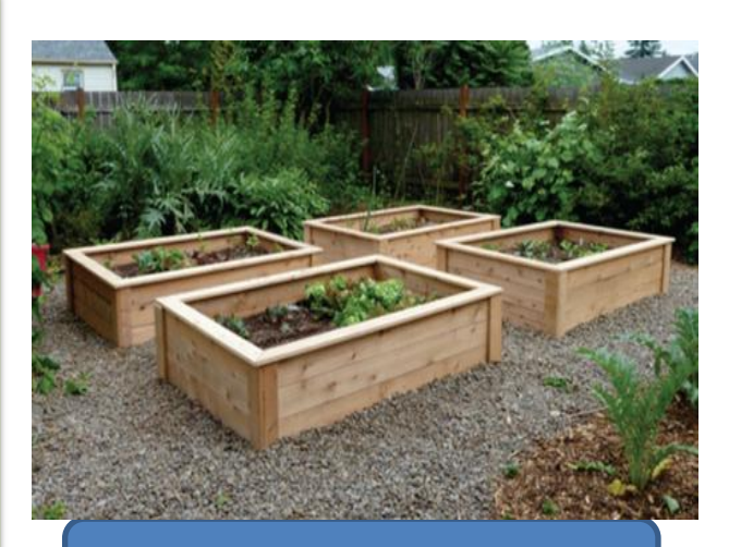
Raised Bed Creation