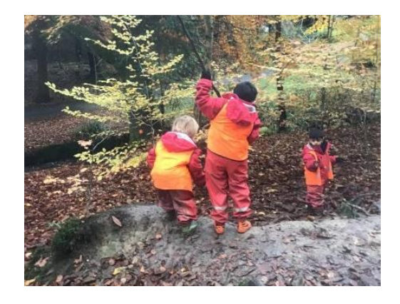
We do not inherit the earth From our Ancestors We borrow it from our Children Old Indian Proverb

Glenwood Family Centre benefits from superb outdoor areas and the children access outdoor learning each day. This means all children will require to bring wellies and a hat when required. All clothing and footwear should be clearly labelled. We are positioned in a fantastic location allowing us to access local areas to further enhance children's experiences. Children enjoy regular opportunities for Woodland Adventures in Eastwood Park, where they learn in a woodland environment. We access the local community to support learning in real situations such as road safety walks and litter picks.