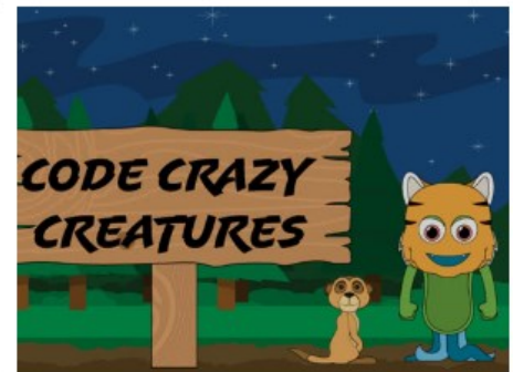
Code Crazy Creatures Grades 2-8 | Blocks