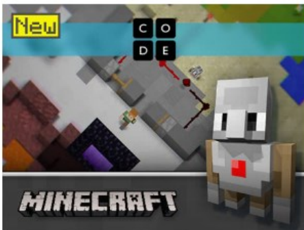
Minecraft Hour of Code Grades 2+ | Blocks

Malala Yousafzai Nobel Peace Prize Winner