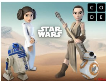
Star Wars: Building a Galaxy with Code Grades 2+ | Blocks, JavaScript