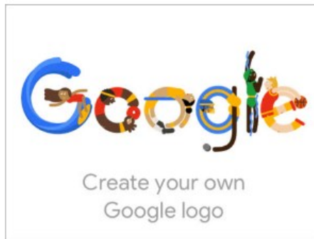
Create your own Google logo Grades 2+ | Blocks, Scratch