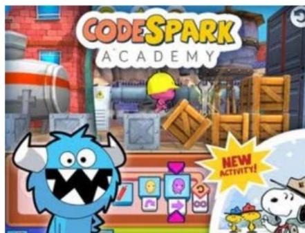
codeSpark Academy with The Foes Pre-reader - Grade 5 | Blocks