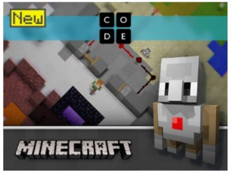
Minecraft Hour of Code Grades 2+ | Blocks