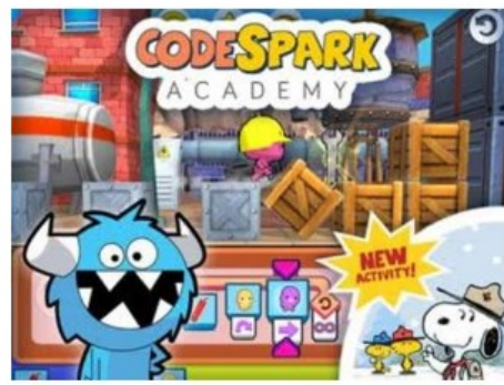
codeSpark Academy with The Foos Pre-reader - Grade 5 | Blocks