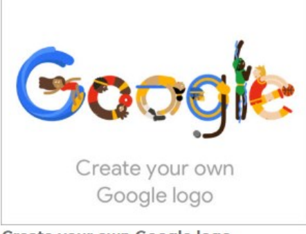
Create your own Google logo Grades 2+ | Blocks, Scratch