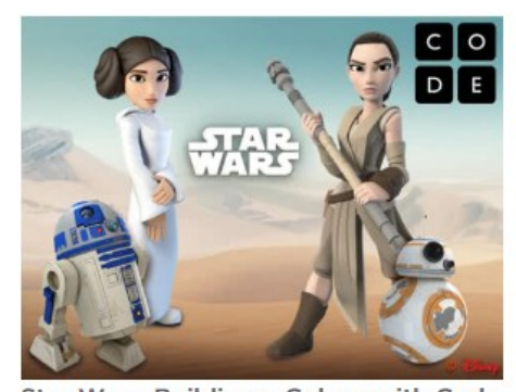
Star Wars: Building a Galaxy with Code Grades 2+ | Blocks, JavaScript