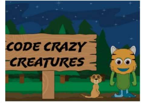
Code Crazy Creatures Grades 2-8 | Blocks