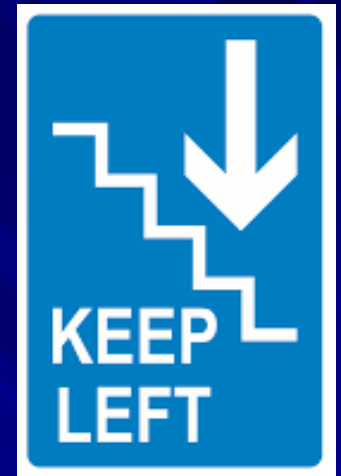
School Stair Map