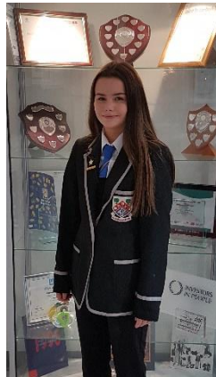
Full Colours - Sport