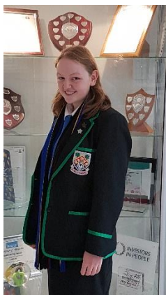
Full Colours - CPA

A badge of Recognition in the pupils’ area of achievement