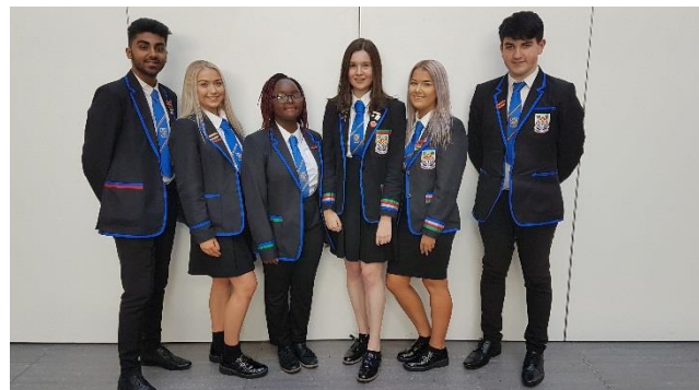
Full Prefect Braiding with and without additional half colours