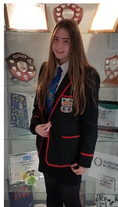
Full Colours - Volunteering