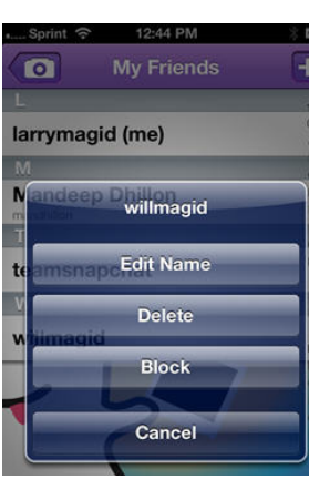
You can block a user from sending you snaps.

• Block the user. To block someone from sending you snaps, tap the Menu button, then My Friends. When you find the person's name in your friends list (or under "Recent" if you haven't added them), swipe right across their name on Apple devices or, on Android phones, press and hold on the person's name, then press Edit and then Block – or just Delete if you want them off your list. And because there is no mass-sharing, no one will see your content unless you choose to send it to them.