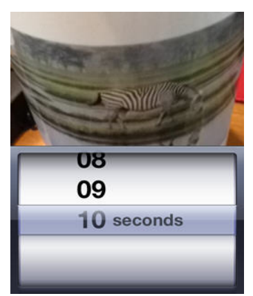
You get to decide how long your photo can be viewed.

Snapchat is a photo-sharing app with a twist. The photos you send disappear seconds after they're viewed – you get to decide how long a photo will "live," from