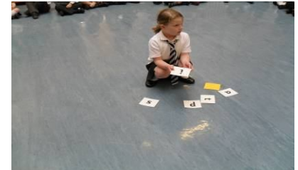
Learning to blend for reading.