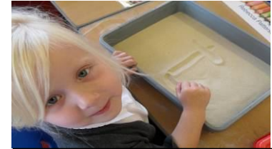
Learning the letter formation.