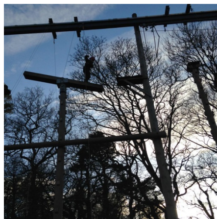
Don't look down! Pupils scramble across the elevated confidence course.