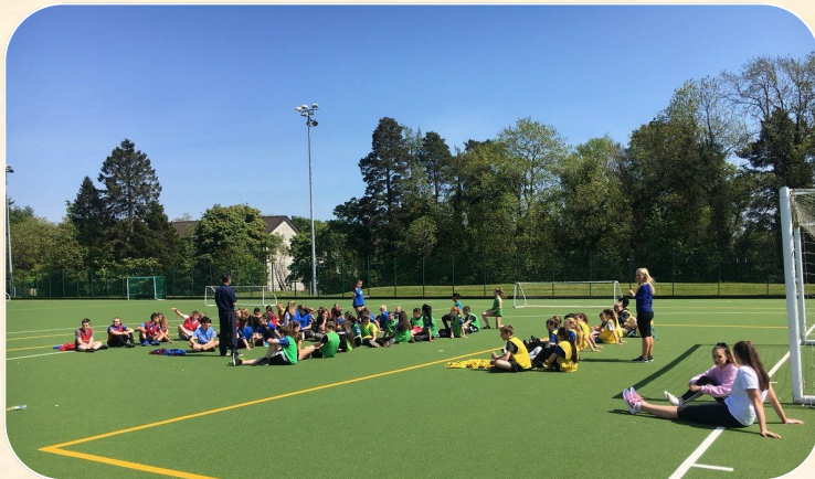
Teams preparing for the 16 x 100 metre relay

S2 1 st Auldhouse 2 nd Capelrig 3 rd Duncarnock 4 th Balgray