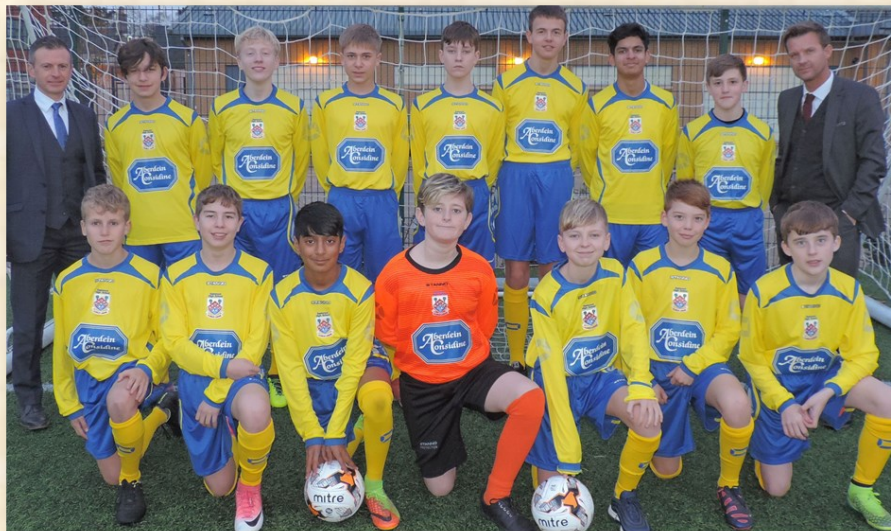
The S2 team with their new strips sponsored by Aberdeen Considine

This year our U14 team finished 3 rd in our group behind Williamwood, Mearns Castle and ahead of Barrhead.