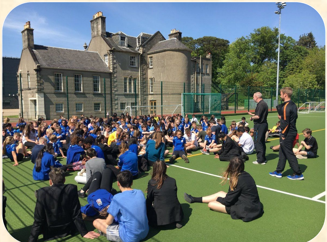
S2 Teams awaiting the final result...