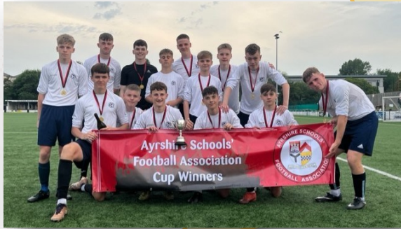
Under-16 Football Team with the Ayrshire Cup