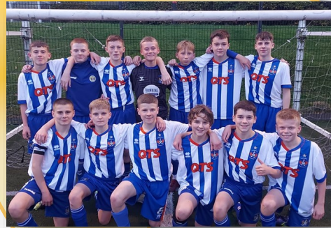
Under-15 Football Team