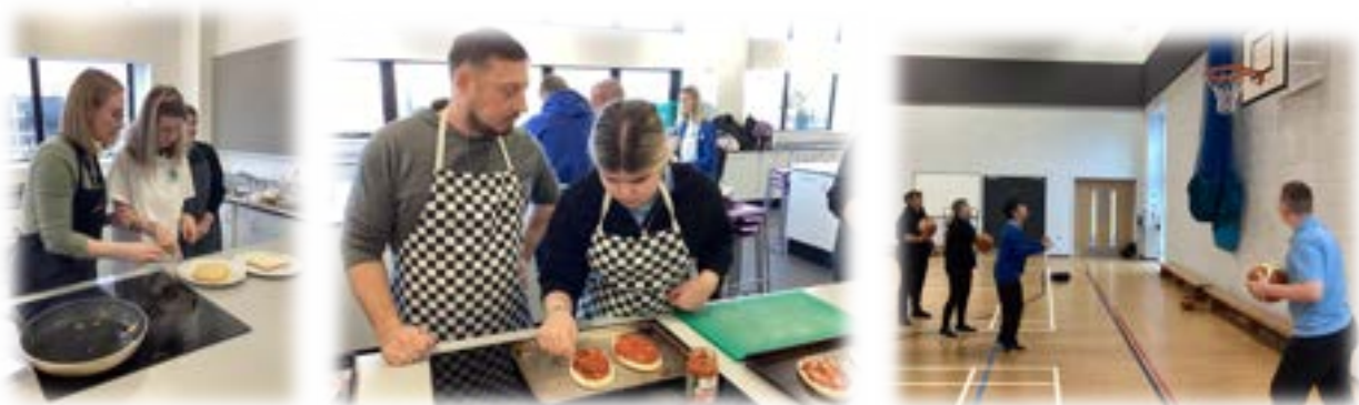
Secondary pupils at Ayrshire College.

Pupils will have the opportunity to attend Ayrshire College if appropriate, alongside peers from Hillside School. Lecturers from Ayrshire College deliver aspects of the Secondary curriculum working co-operatively with school teaching staff.