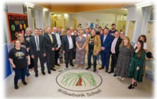
Pupils, Staff and Special Guests at Willowbank's 10 th anniversary celebrations