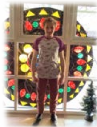
Pupils exploring aspects of religious festivals as part of an SQA National 1 Unit studying Life in Another Country.