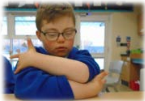
Many pupils are highly skilled at using Makaton signs and symbols to communicate.

Over the past few years, we have developed our use of complimentary therapies to enhance the existing curriculum, including pet therapy, equine therapy and Rebound Therapy.