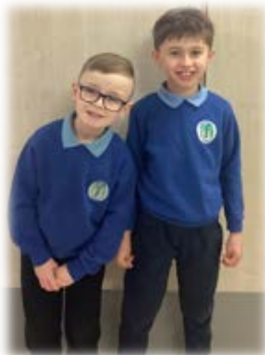
Our school uniform

Visit our clothing grants and free school meals page to find out more and apply online.