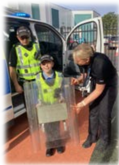
Visits from PC Scade are always a highlight

We also work with local colleges and universities to provide placements for student nurses, teachers, paramedics, early years practitioners and various other courses.