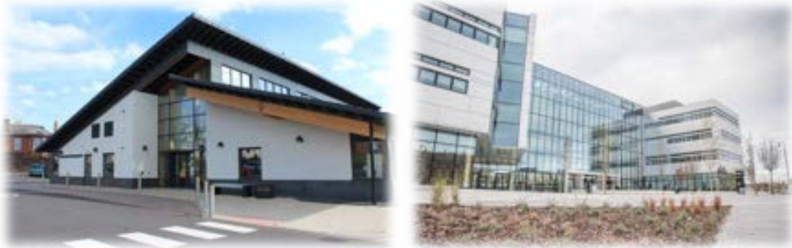
Previous positive destinations pupils have moved to include the Sir Alexander Fleming Centre and Ayrshire College.

For more information on Transition planning, please contact your child's allocated Social Worker, or the Duty Social Worker.