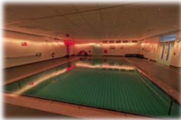
School swimming pool

Teaching spaces include 15 classrooms, Home Economics classroom, PE Hall, Dining Hall and Swimming Pool. Pupils also benefit from breakout spaces including two Conservatories, 'The Wee Den', Soft Play and a Sensory Room. The playground and sensory garden also provide safe outdoor spaces for teaching and learning as well as independent exploration.