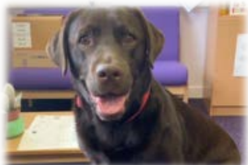
Pet Therapy is a firm favourite amongst most pupils!