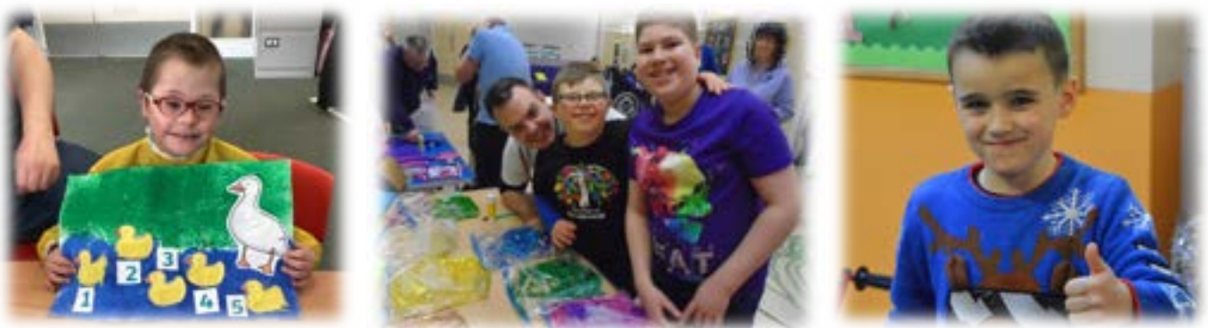
Positive Relationships lead to a happy, safe and purposeful learning environment

All schools in East Ayrshire follow the guidance outlined within the council's Anti-Bullying – Respect for All Policy .