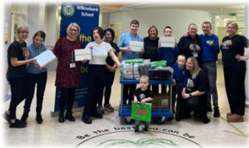
Friends of Willowbank presenting iPads to staff and pupils

Friends of Willowbank is a charity and is a group of parents, staff and community members who share an interest in the school and wish to be involved in organising and assisting in events and fundraising. They support the school to help raise funds and plan social events for the benefit of the children and young people.