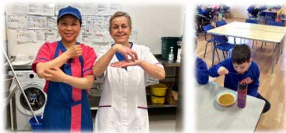
The Dinging Hall is a welcoming, safe environment for pupils