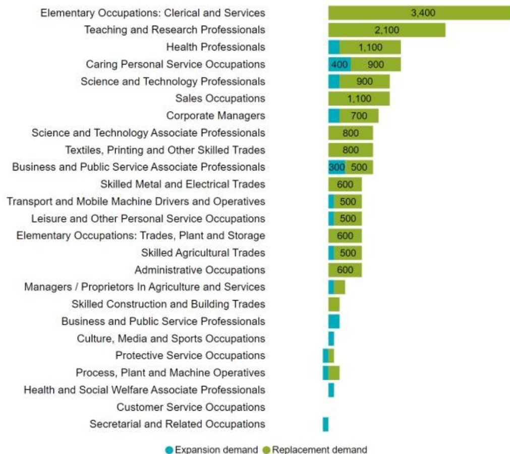
Forecast Total Requirement by Occupation (2024-2027), Ayrshire

https://www.skillsdevelopmentscotland.co.uk/media/j0if4bqs/rsa-regional-report-ayrshire.pdf