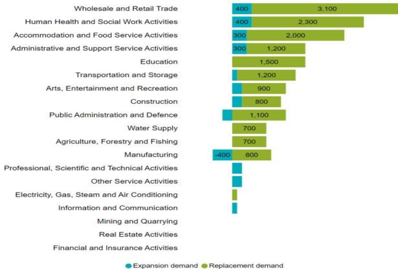
Forecast Total Requirement by Industry (2024-2027), Ayrshire