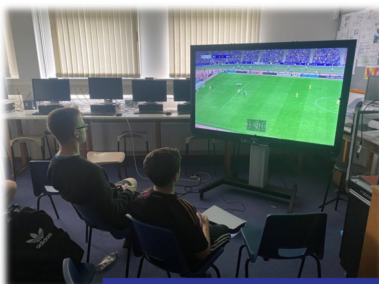
Gaming Day: FIFA Tournament