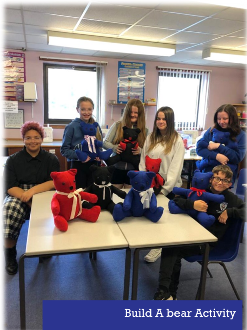
Build A bear Activity