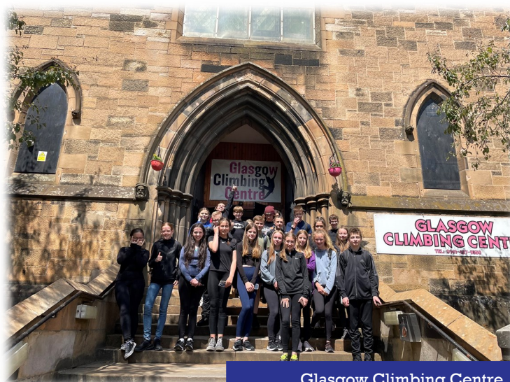
Glasgow Climbing Centre