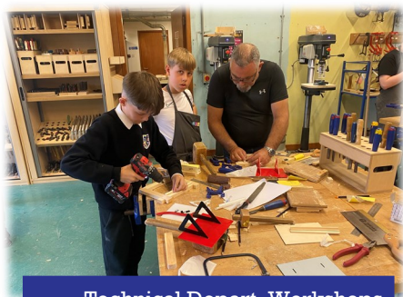
Technical Depart. Workshops