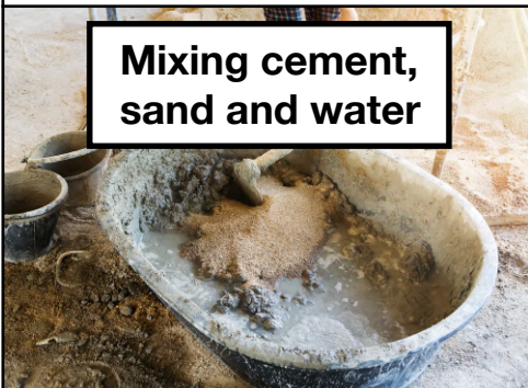
Mixing cement, sand and water