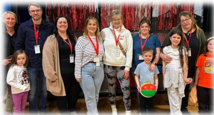
Parent Council members at Ongo Bingo