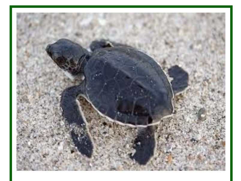
To avoid any predators, hatchlings will generally wait until night to head for the ocean.