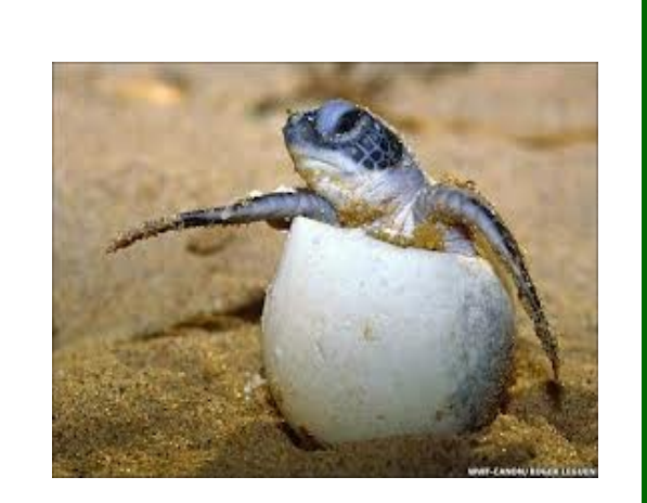
sea turtle eggs hatching