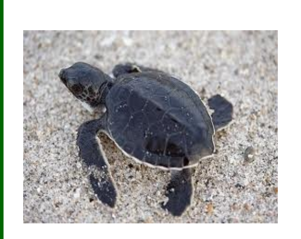
baby sea turtle