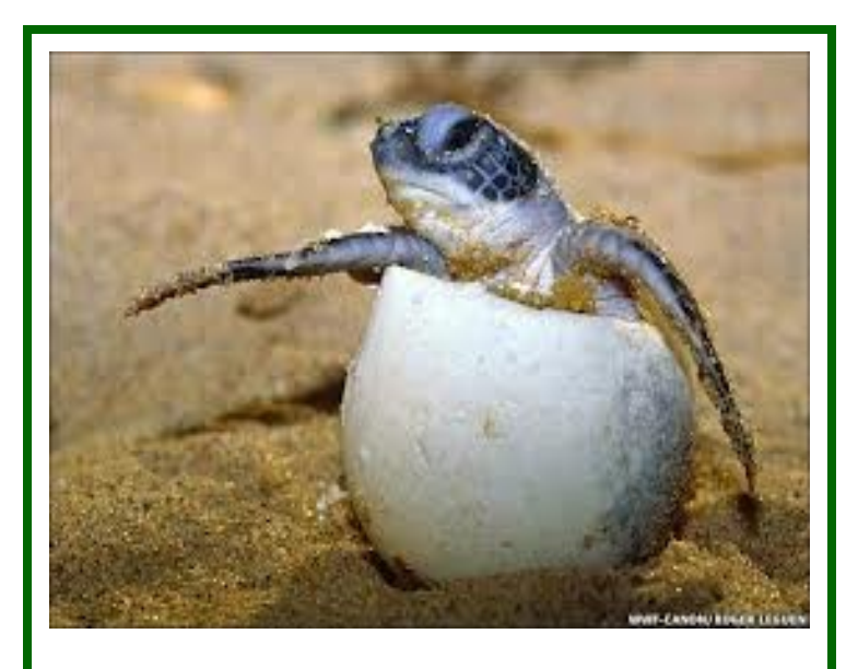
When fully developed, hatchlings break through their eggshell and slowly dig their way to the surface.