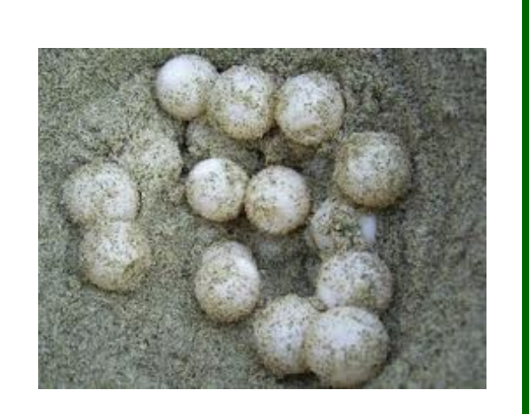
sea turtle eggs