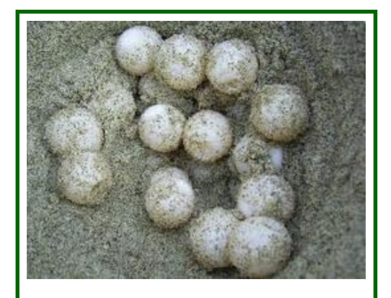
Females use their back flippers to dig a small hole into which they deposit their eggs.