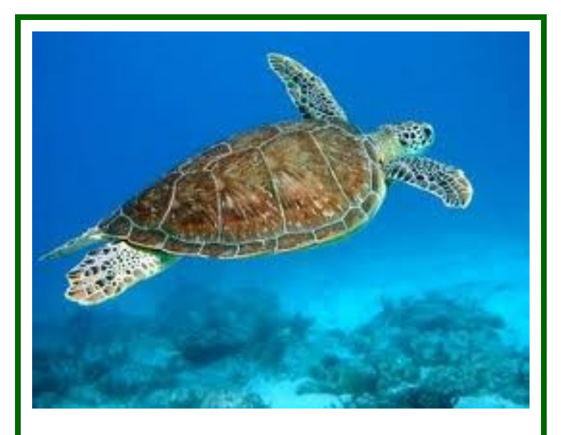
Each nesting season, most females return to nest at the same beach which they hatched on.