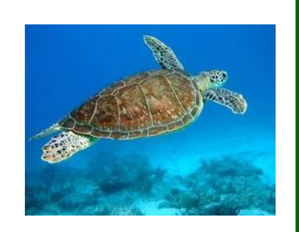
adult sea turtle