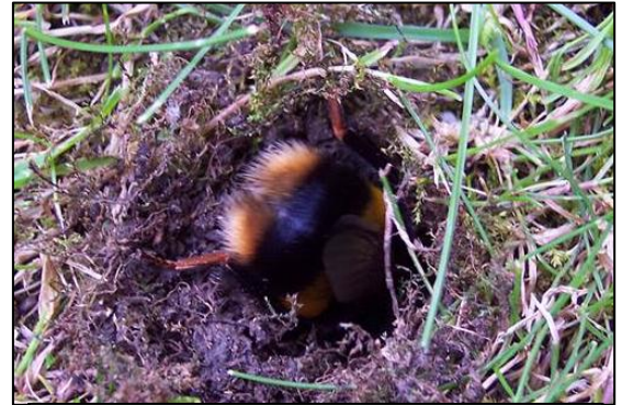
A queen bumblebee preparing for hibernation.