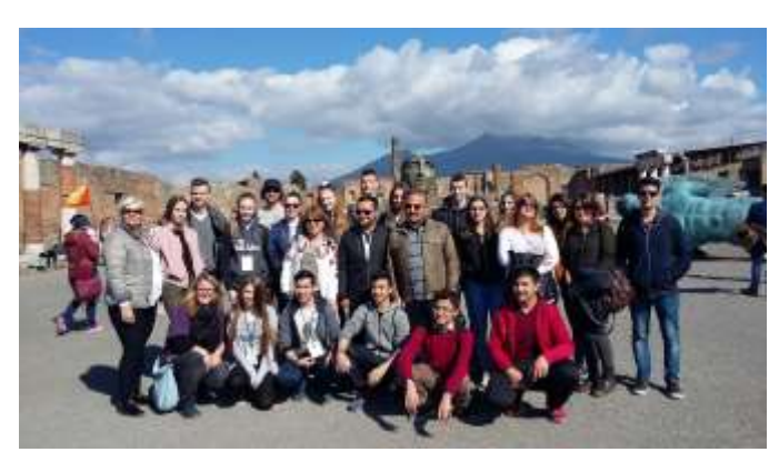
Visiting Pompeii, Mount Vesuvius shrouded in cloud in the background.

One of the highlights of the visit was an excellent workshop on film production which was delivered by a former student and award winning cinematographer. Our students were certainly gaining new skills. Of course there was time for sightseeing and socialising, for making new friends, having new experiences and for practising and extending our language skills.