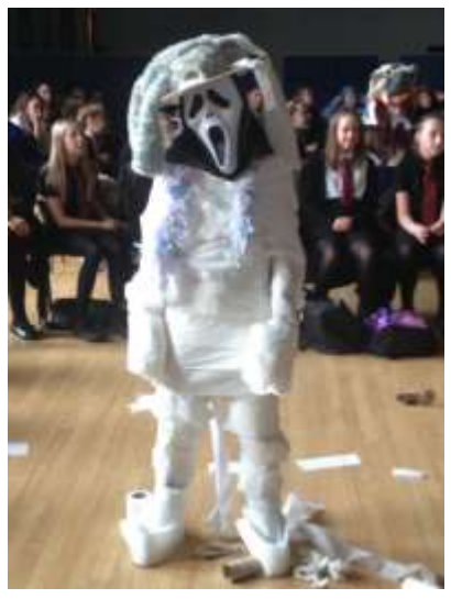
ACE Rewards Hallowe'en Assembly

This follows on the successful Hallowe'en Assemblies run for those who achieved Block 1.