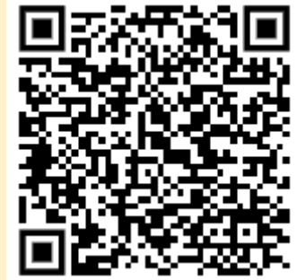
Technology (Software engineering) Apprenticeship