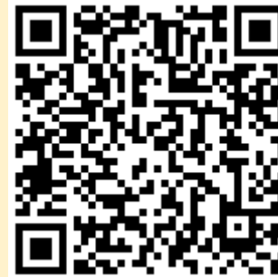
Financial Services Apprenticeship

Our Degree Apprenticeships in Technology and Finance are based in London, Bournemouth, Edinburgh and Glasgow. Find out more about the currently open opportunities by following the links opposite: