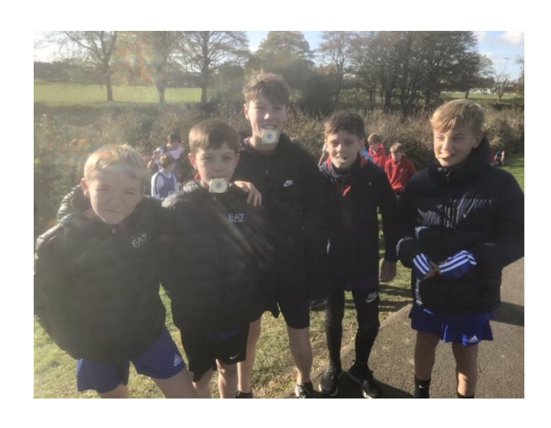
S1 boys with their team gold medal.