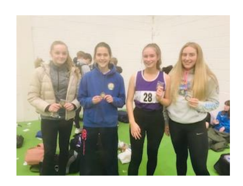
Senior girls with the 3<sup>rd</sup> place team bronze medal.