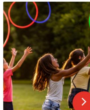
Coronavirus guidelines for children