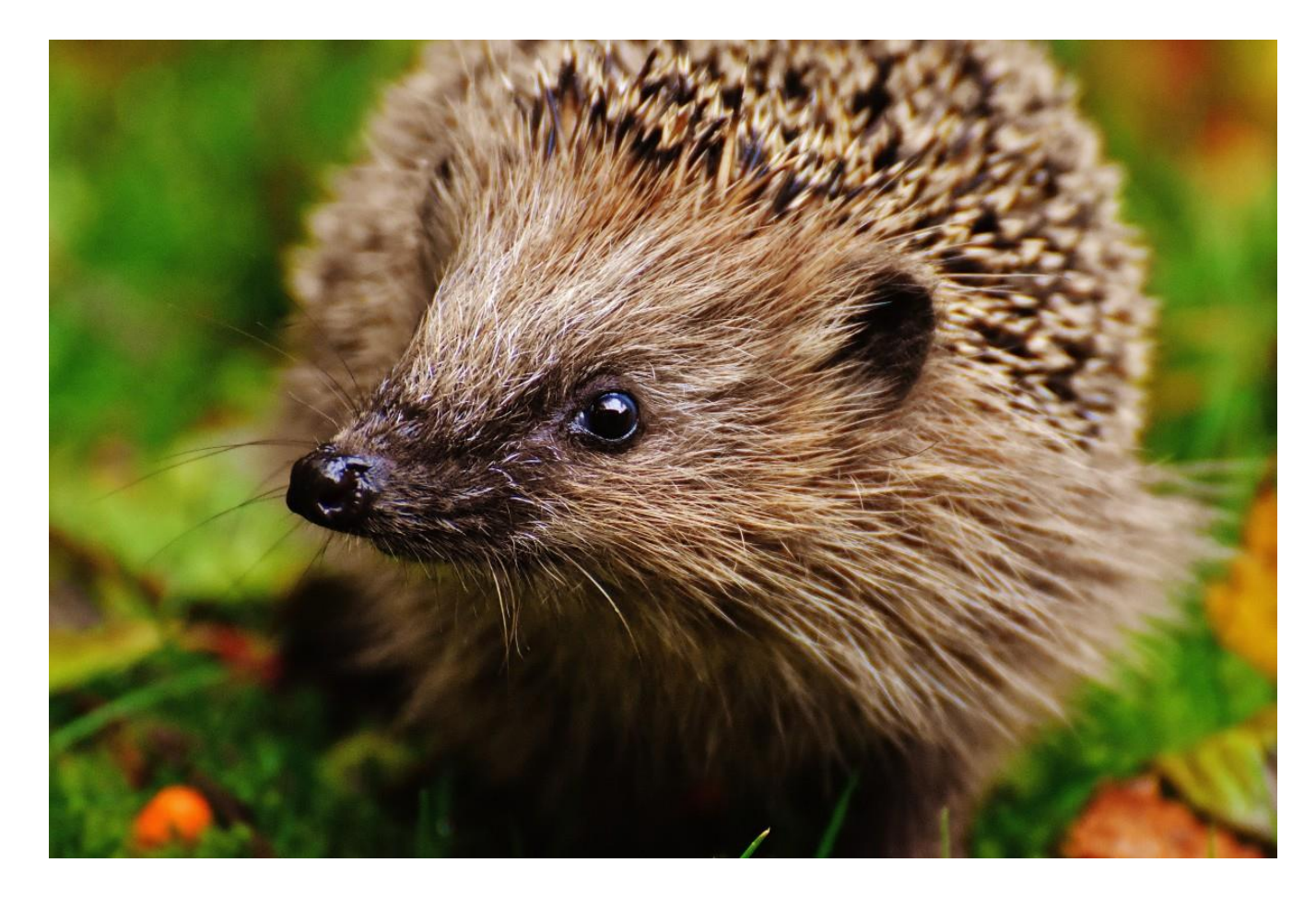
Scottish Government, Nature Restoration Fund 2021-22

HEDGEHOGS - EAC LOST Theme for Progression in STEM Resource Summary