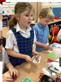
Christmas Fayre tag making