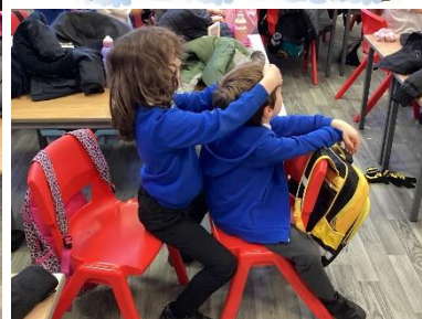
Massage in Schools