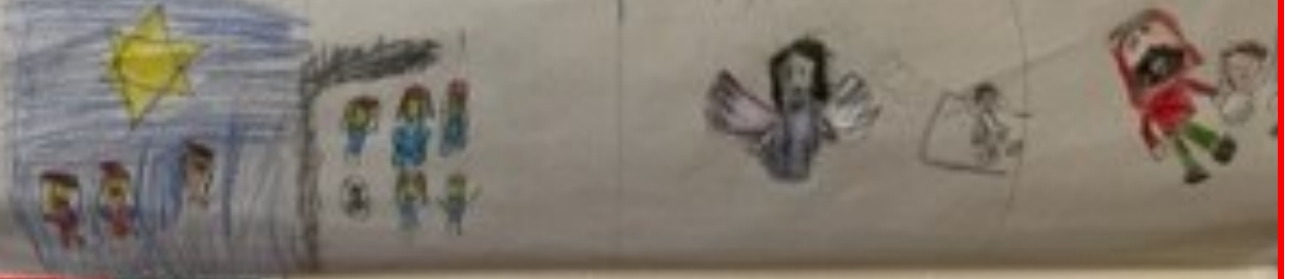
P3 R7 Nativity Stories

Angel Gabriel came down to tell Mary she was going to have a baby called Jesus. Mary wanted to tell Joseph that the wife was pregnant that would be God's son. They traveled to Bethlehem and later that night Mary gave birth in the stable. The angel Gabriel told the three wisemen visited them and wanted to kill him. And after they heard about Jesus that they went to Egypt.