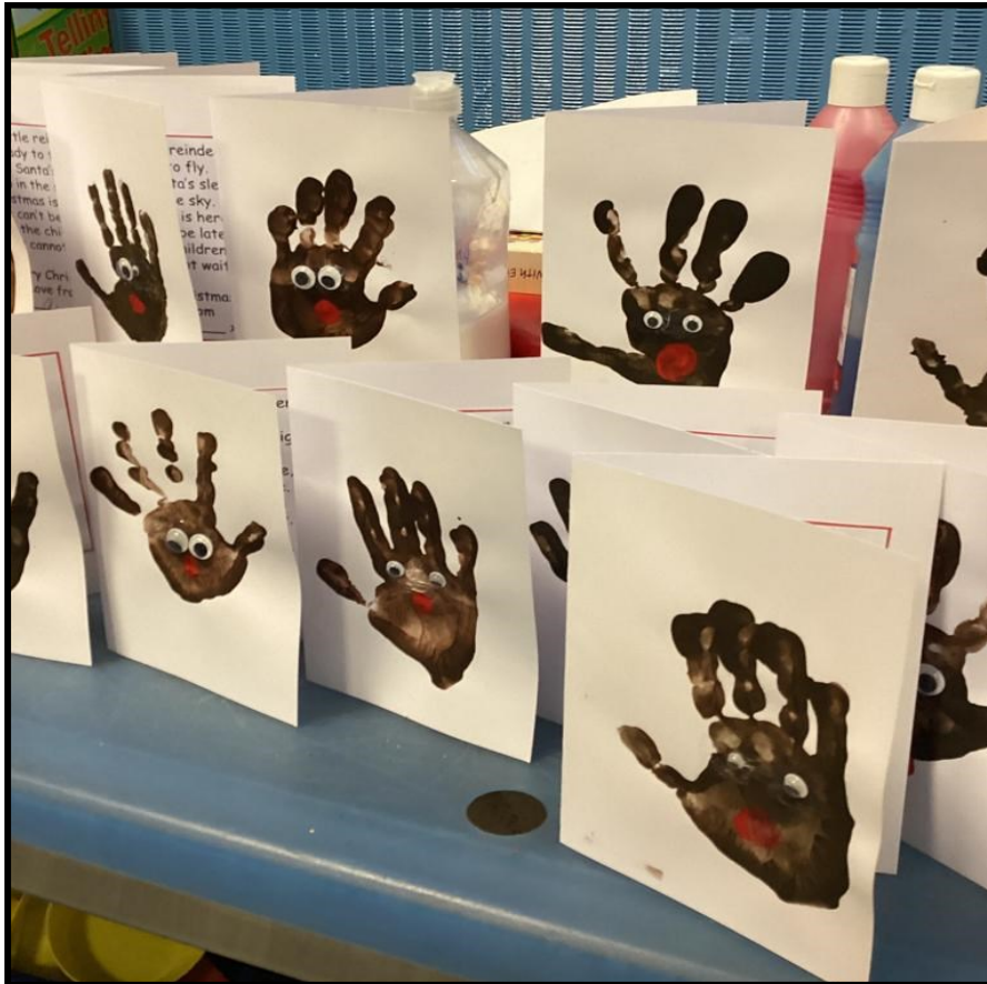
P1 Christmas Card designs