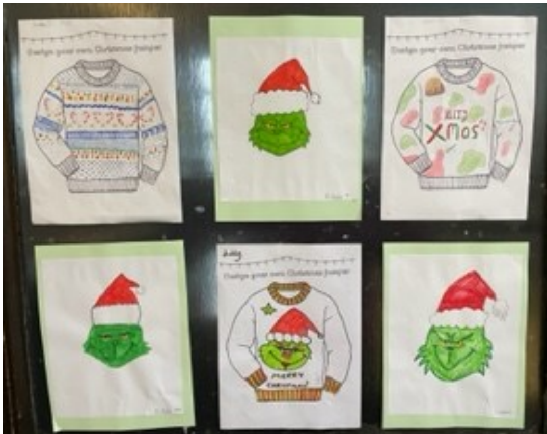
Grinch Artwork from various classes.