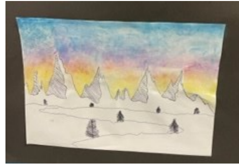
P6 R15 painted lovely Winter landscapes using watercolours.