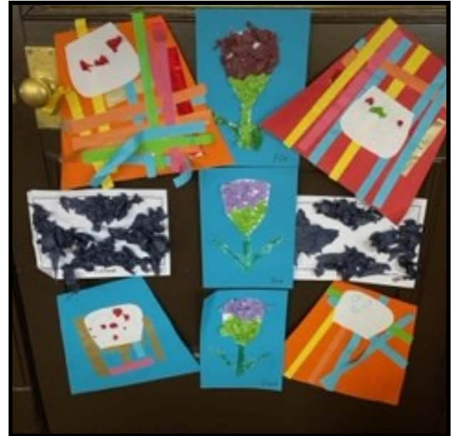
P1 made kilts and flags to celebrate St Andrew's Day