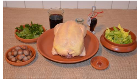
Roman Clothing and Food

This is a suggested schedule to help you plan out your week. You should feel free to make changes to suit your own circumstances. I have given the activities star ratings to guide you in your choice of activity, you could set yourself a star goal each day or see how many stars you can get over the week. There are lots of stars available each day. You can gain a star for each day you complete the daily tasks. Again this is just a guide you should feel free to adjust the schedule and star target to best suit you and your child. Further detail on each activity is given within the rest of the overview.