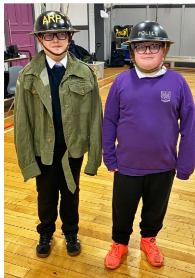
World War 2 Workshop