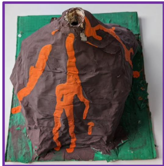
One of our awesome volcanoes