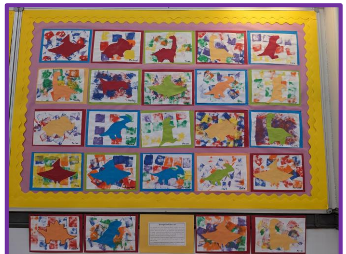
Our fab sponge print dinosaur art

Some of our classmates have already achieved their Bronze Award for Star Points, & competition for Classmate & Table of the Week continues to be fierce. We have started to share our achievements & display work of which we are especially proud. We have started to get outside a bit more now that the weather is getting better & earned lot of miles for our school's Journey to Jupiter.