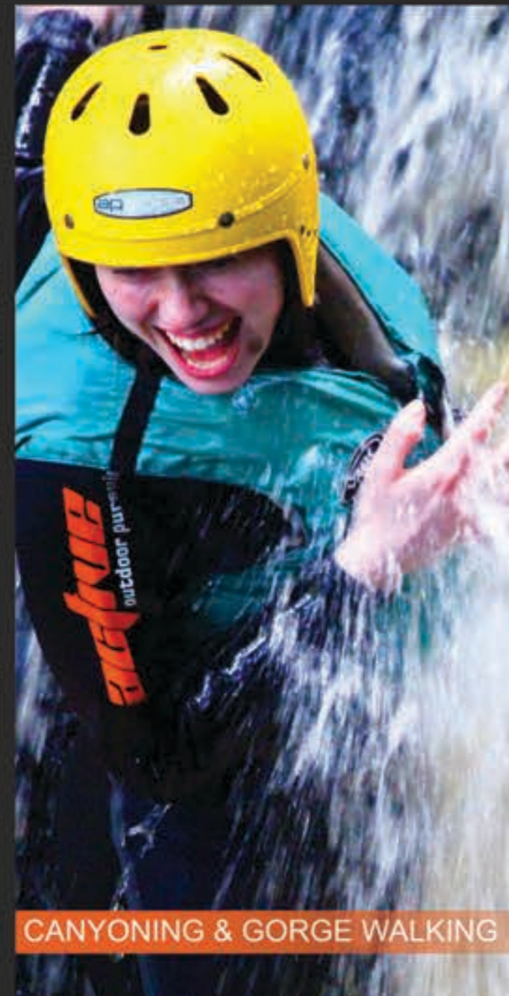
CANYONING & GORGE WALKING