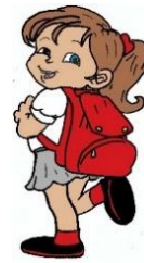
Picture taken of Onthank Primary 23 rd Dec 2020

Your child's P1 classroom will look different to their nursery environment, but will still have lots of opportunities for learning through play. The most important thing is at the start we will be making sure everyone feels welcomed and finds something they enjoy in school.