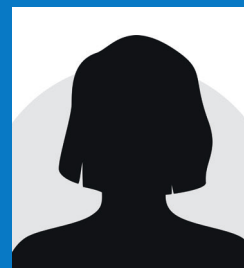
Nursery Nurse Miss Jade Loch